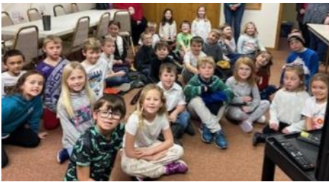
1s & 2nd Grade Release Time