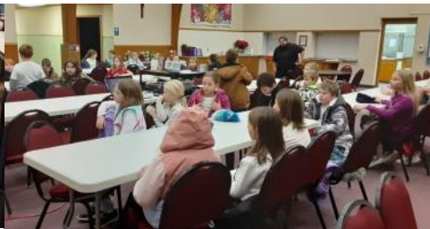
3rd & 4th Grade Release Time