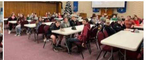
5-8th Grade Release Time