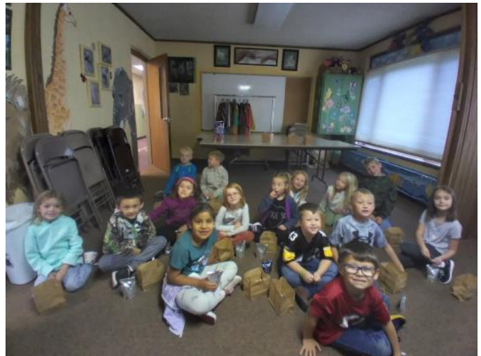
Our first graders