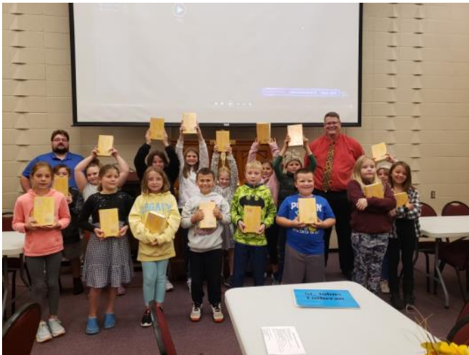
3rd graders with their new Bibles