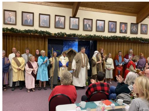
Door prizes were given out after the Christmas story performance.