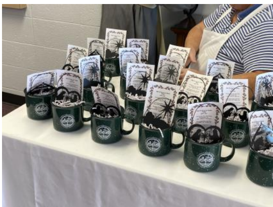
Each family got a mug and ornament.