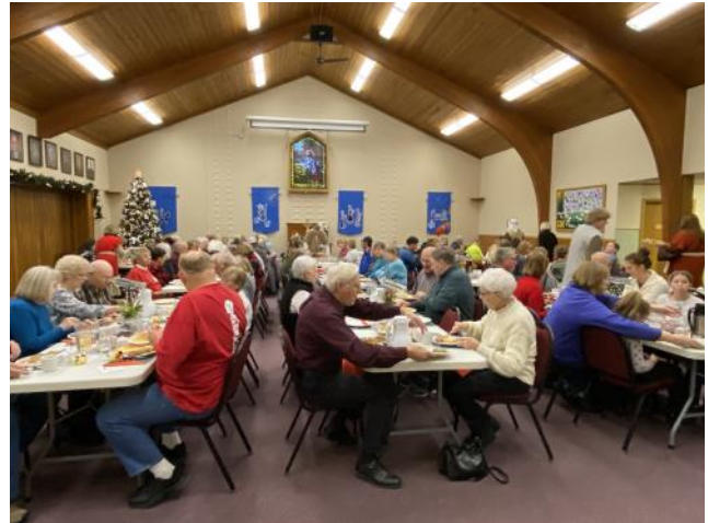
The crowd enjoyed a delicious meal prepared by the Fellowship Board at beautifully decorated tables.