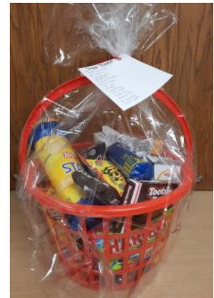
Donna Neumann also brought in this BIG snack basket.