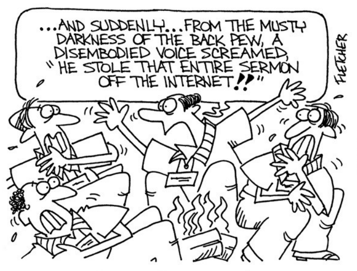
Spooky stories around the Pastor Retreat campfire.