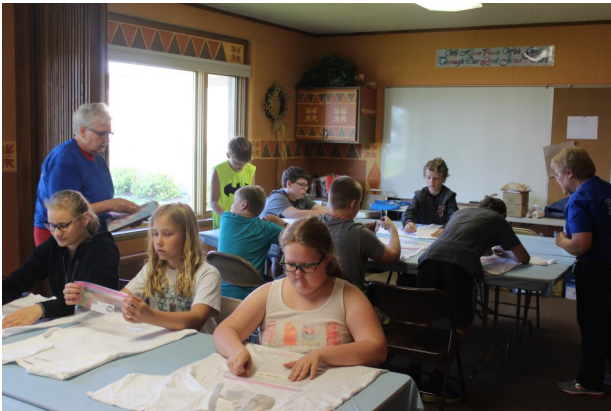
Decorating shirts at crafts