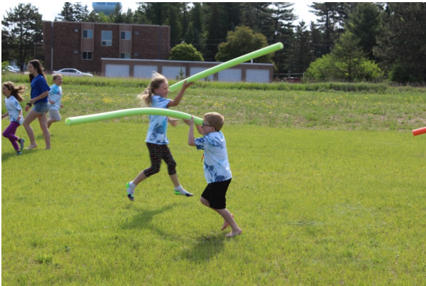
Fun and games outside