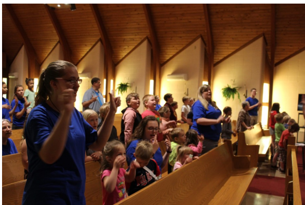
Learning new songs during opening