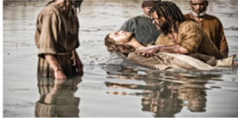
It is fitting for us to fulfill all righteousness