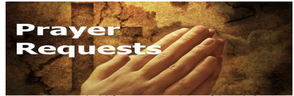
(Names in bold face are members of St. John's)