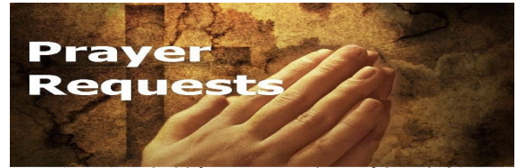
(Names in bold face are members of St. John's)