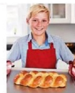
Bread Making Activity 3rd Grade through 6th Grade Saturday September 9th at 10 am

St. John's Lutheran Has open registration for all kids Pre-K thru 6th grade. Please call our church office for more information! (563) 252-2355