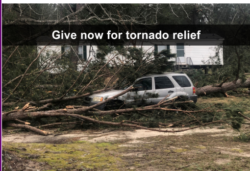
Give now for tornado relief

On March 3, powerful tornadoes hit Alabama, Georgia and Florida, causing widespread destruction. At least 23 people have died in Lee County, Ala., and others are still unaccounted for. More than 1,000 homes have been damaged, and thousands of people have lost power. Lutheran Disaster Response is working with those in the impacted states, including partnering with congregations in the Southeastern Synod to respond with immediate relief. Gifts to Lutheran Disaster Response designated for "U.S. tornadoes" will be used to help those affected by tornadoes until the response is complete. Together, we can help provide immediate and long-lasting support. Please give today.