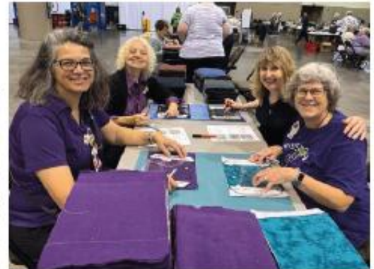
Lutheran Women in Mission tracing out patterns for feminine hygiene needs.