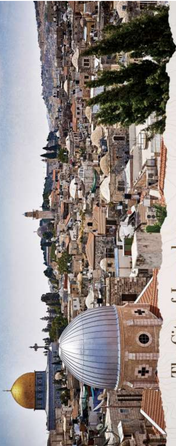
The City of Jerusalem