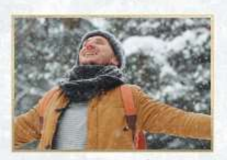
WEEK 3: Fraise