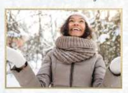
WEEK 4: Froclaim