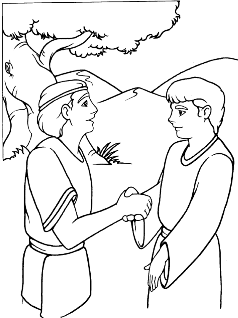
Esau Sells His Birthright to Jacob Genesis 25:19-34

Copyright © CalvaryCurriculum.com Used by Permission