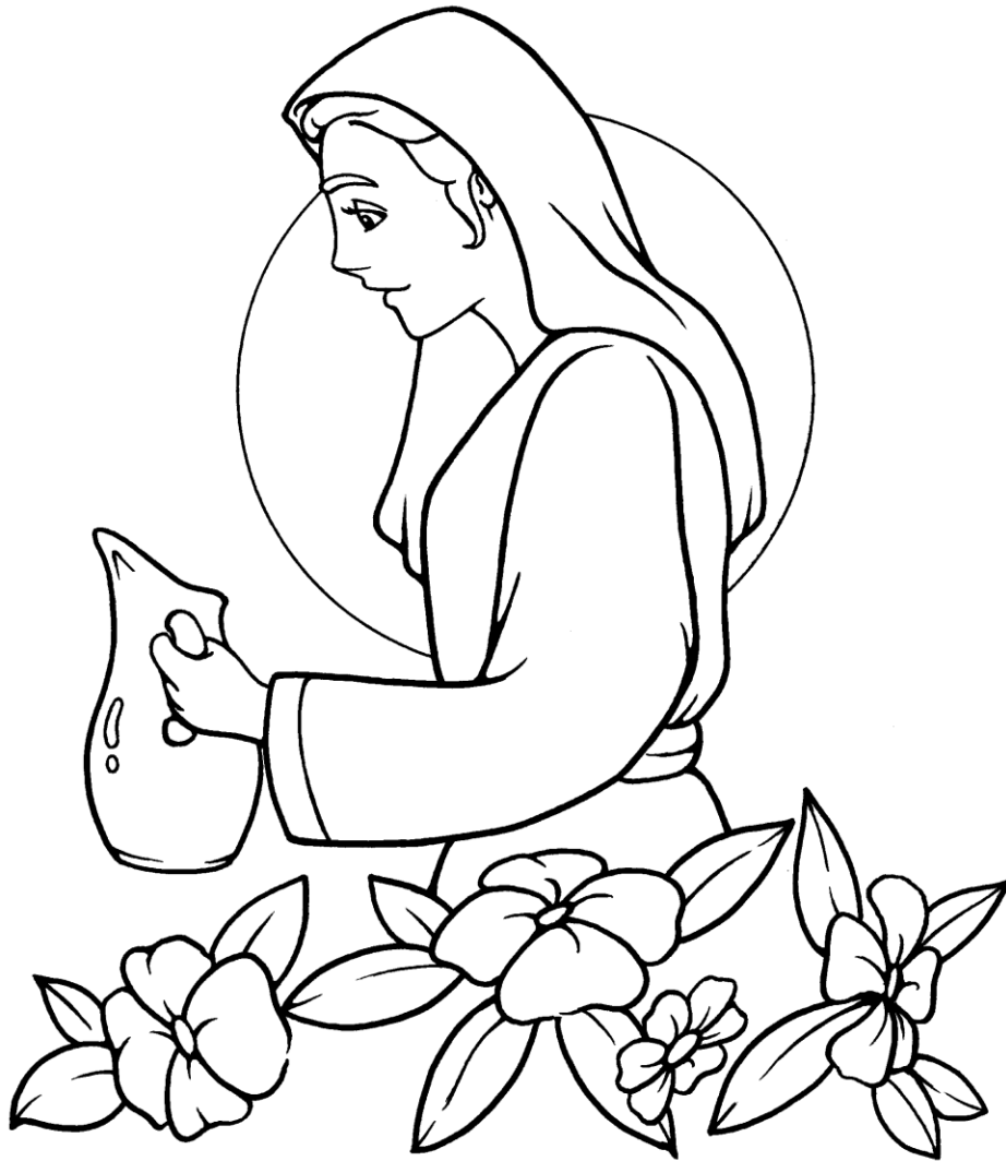
A Bride for Isaac Genesis 24:1-67