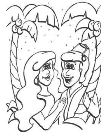
Isaac and Rebekah