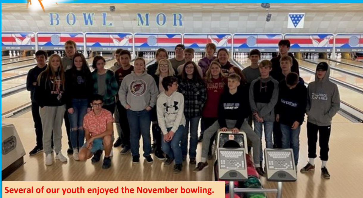
Several of our youth enjoyed the November bowling.