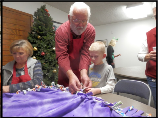
SOME PICTURES FROM THE KIDS CHRISTMAS PARTY HELD DECEMBER 15!