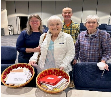
Christmas cards, ready to go.

Christmas Card Writing, Caroling at the Beatitudes, Wrapping Angel Tree Gifts, Assembling Care Kits for the Unsheltered, Serving Pancakes at Grace Lutheran