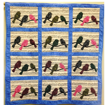
This quilt, created by Sally, hangs in the Music Room.

Please come see the current quilts on display on the church patio, Sunday, December 3 rd , between 9 and 11:30.