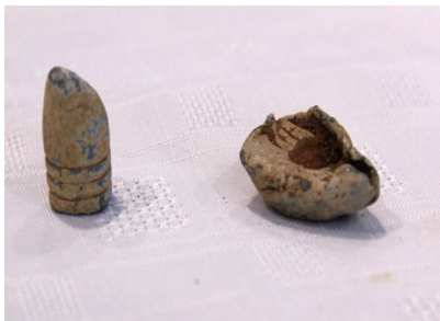
Authentic bullets were passed around.