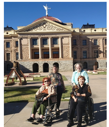
Right: These OPW ladies enjoyed their self-guided tour of the Arizona Capitol Museum.