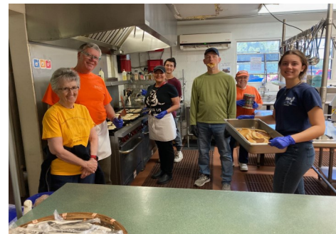
These OPC folks recently prepared and served a Pancake Breakfast to the homeless at Grace Lutheran Church.

Mission Table – Each Sunday morning, the Mission Table on the Patio has information on many of the mission projects OPC participates in and includes sign-up sheets for volunteers to participate in our various projects.