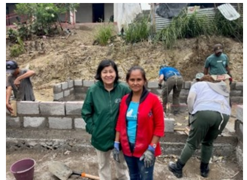
A recent home building project