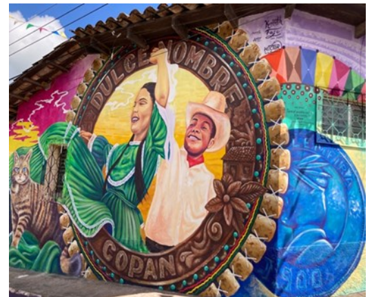
A typical mural in Dulce Nombre