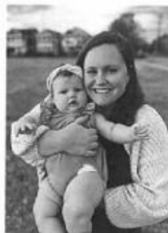
Mother and Daughter in their fall outfits