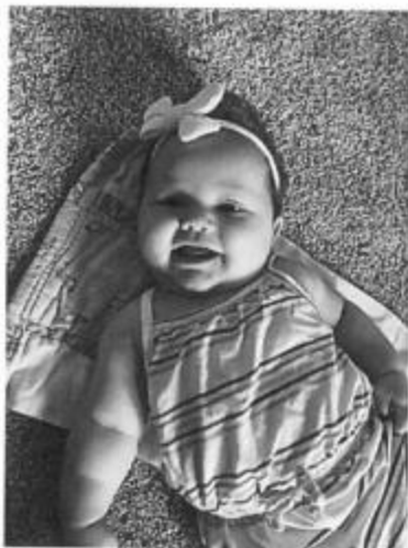
"Mommy, I want to MOVE."