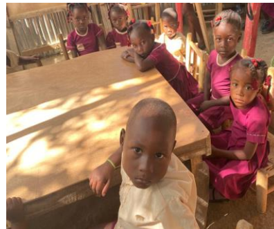
Pre-school students at school in Non Fombrun. This school has no sponsor or funding.