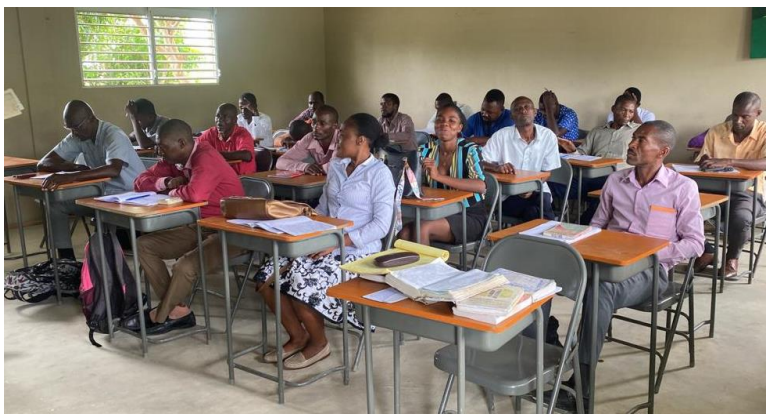
On Saturday's adults attend Lutheran Seminary in Laotchikit. Classes are held with professors in Haiti, Canada and the United States via the internet.

Currently at the Lutheran School in Laotchikit there are nine classrooms with a medical clinic, sewing school, Lutheran seminary, farming projects, and children's orphanage. Over the years, a school was built on the church grounds for ages preschool through sixth grade and was expanded to 10 th grade. Students walk to Hinche to attend grades 11 th through 13 th . We are hopefully another grade will be added to the Lutheran school in Laotchikit next year. There are over 120 middle and high school students who need scholarships to attend school each year. The cost of a scholarship is $120 per student per year for tuition, books and uniforms.