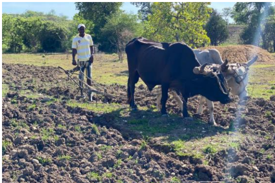
A farmer plowing with a team of oxen. He is able to plant his field with help from a farming grant from Mt. Pisgah.