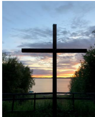
Midnight sun at