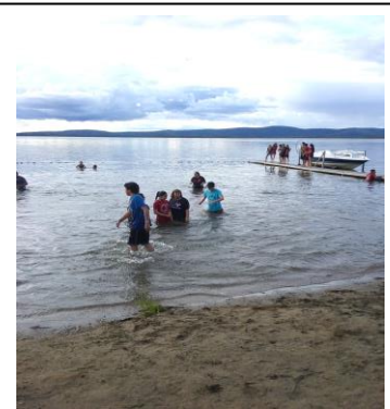
Teen Camp baptisms