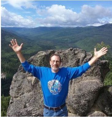
Thanking God up