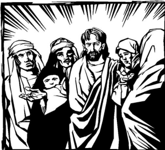
Jesus Teaches the Crowds...