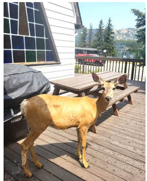
Too early for the picnic