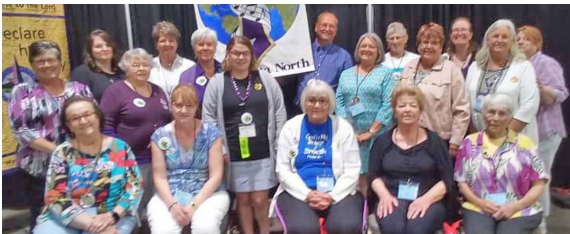
Pictured are the voting delegates who represented the LWML Minnesota North District at the LWML 40th Biennial Convention in Milwaukee, held June 22-25.

Both ladies encourage young women to apply to be a LWML Minnesota North District YWR at a future convention. We appreciate our YWRs and look forward to seeing future participants at upcoming events.