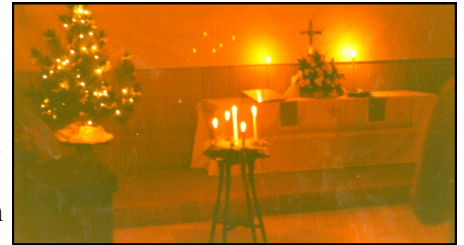
Christmas Eve 1980, Keller Lion's Club

1990: our Altar Guild spent many hours making a fish-shaped Chrismon ornament for each family in the congregation.