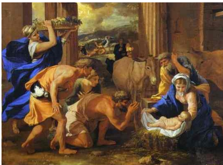
Detail: Nicolas Poussin. Adoration of the Shepherds . 1633. Oil on canvas. National Gallery, London, UK.