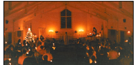
Christmas Eve 1990

For the Lord is good; His steadfast love endures forever and His faithfulness to all generations. --Psalm 100:5