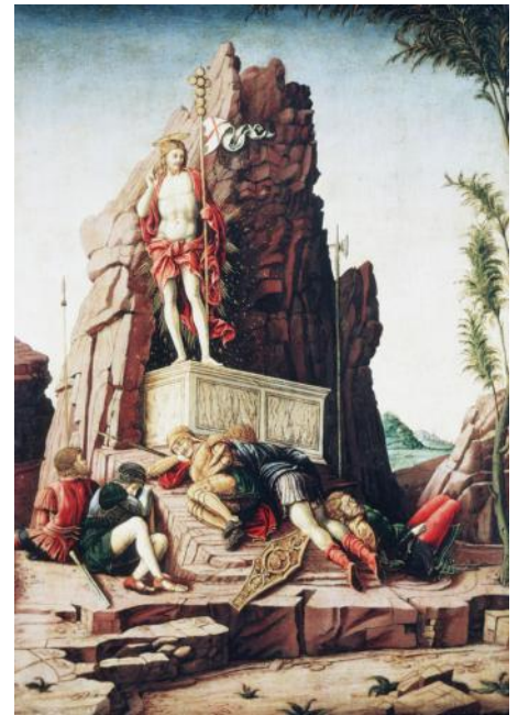
Andrea Mantegna (1431-1506). The Resurrection

But the real foundation for our confidence in Jesus - and everything else in Christianity - is His resurrection from the dead. After He cleansed the Temple the Jewish leaders demanded to be shown credentials of His authority from God. His famous answer involving the destruction and rebuilding of the Temple was a cloaked prophecy of His resurrection on the third day. Thus, when required to show proof of His identity, Jesus pointed to the empty tomb. The resurrection is actually the foundation and proof for Christianity itself. If Jesus fulfilled this prophecy, then why would anyone dispute His claims and teachings on any other matter? The Resurrection is the final and ultimate proof that He is the Son of God with power (Rom 1:4). And if He is the Son of God come down from heaven, then the Scriptures of the Old and New Testaments are God’s revelation from heaven because JESUS assures us of their accuracy and authority (John 10:35 and others). If Jesus is the Son of God come down from heaven then His interpretation of the Old Testament and of His own ministry is absolutely trustworthy. The prophets do, indeed, bear witness to Him (John 5:39, Acts 10:43). If Jesus