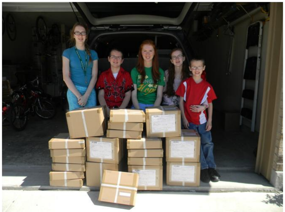
March 2014 order being shipped off to Kenya, Malawi, and the Philippines