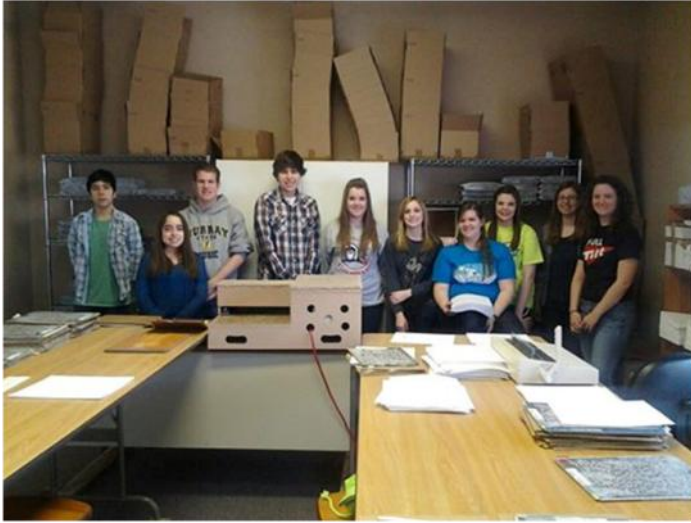
Spring Break 2014 Volunteers produced 31 volumes of the book of Ezekiel.

Messiah's Braille Center #132 officially reopened in April! We have received our new zinc plates for our center, and are excited to announce that we are now printing Ezekiel in Swahili, Lutheran Service Book (LSB) in English, and Rainbows are Forever in English.