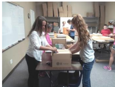
Step 7: Make boxes and stamp