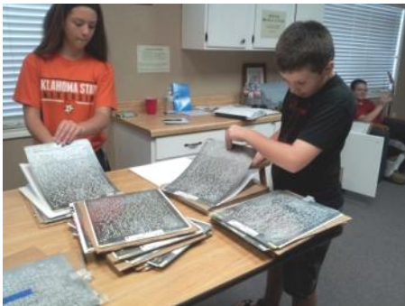
Step 1: Stuff zinc plates with paper