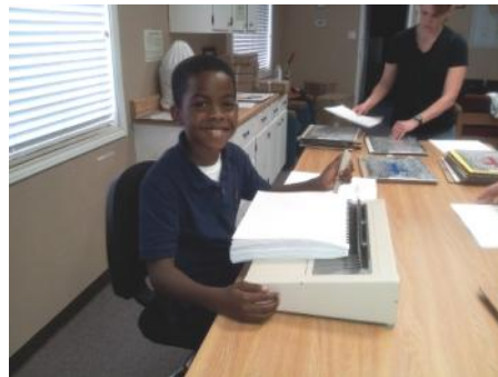
Step 5: Bind embossed pages