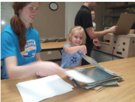
Step 4: Dump plate and remove paper