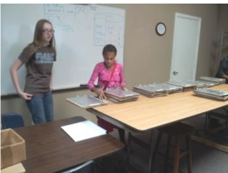
Step 2: Place the plates in numerical order