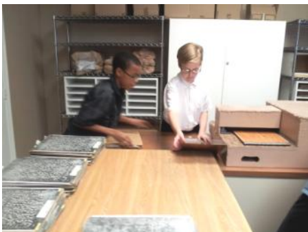
Step 3: Send plates through roller press to emboss the Braille dots