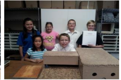
Oct 26 th Messiah's Junior Youth printed 14 volumes of Ezekiel