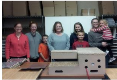
Oct 14 th Tuesday Night Open Family Workshop