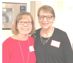
More pictures from the Progressive Dinner