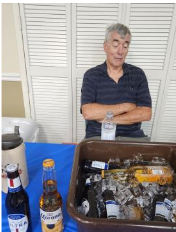
Photos from Oktoberfest 2023