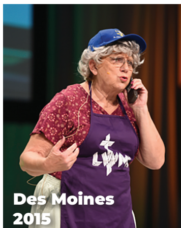
Des Moines 2015

As 'Ruby' she gave a different perspective on words that begin with "P," saying that "I'm usually the triple-P person when it comes to missions: pew, pray, and pay!"