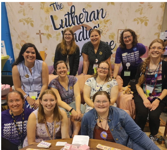
On Friday night, some of the YWRs headed to the Lutheran Ladies Lounge to refresh after karaoke singing and dancing.