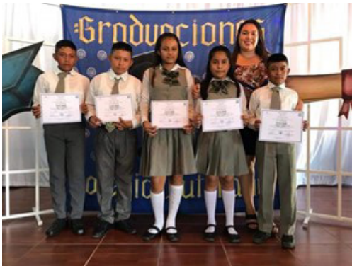
^ These children graduated from sixth grade through Lights for Christ in Zacapa, Guatemala, and will be attending middle school, thanks to scholarships from LWML Mission Grant #8.

Following up on last week's eNews article on the funding of 2019-2021 Mission Grant #8 — Lights for Christ Scholarship in Zacapa, Guatemala, LWML is pleased to share photos of the graduating students at Divine Savior Lutheran School. This grant supplies funding for an education program that covers most of the students' basic needs and equips the children in grades 1-6 to reach out into their community with the Gospel. Another photo shows two women from Holy Cross Lutheran Church in Wichita, Kansas, holding the LWML check for this Mission Grant.