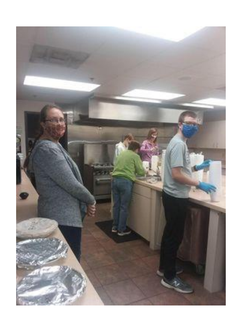
LWML members and the youth group working together.

Before you cancel your events because you cannot do them the way you always have, think outside the box and see if there is another way to do it. Consider having your group do a similar soup supper event on Super Bowl Sunday this February for a fun Souper Bowl event!