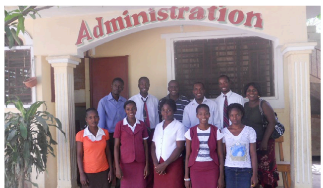
The school administrators and teachers during the 2011-2012 school year.

Dear Jesus, You told Your disciples that little children should be brought to You and taught about salvation. The children attending Nord Est Haiti Lutheran Primary School are in need of this teaching. Bless those who are caring for these children, feeding their bodies, minds, and faith. Give them the wisdom to place Your Word in the hands of these children every day. Bless this building project so a safe and secure building results in continuing care for these Your children. Strengthen the faith of all involved with this mission. We pray in Your name. Amen.