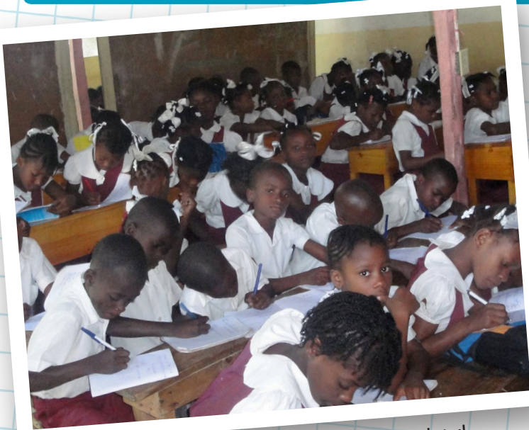
Grades 1-4 meet in church/school building for classes. Outside is the kindergarten classroom.