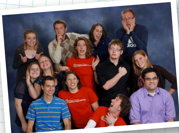
Student Leadership at Ball State University in Muncie, IN

LWML will share God's love on the college campuses of our nation by strengthening and expanding campus ministry through the online virtual LCMS U, reaching more than 100,000 students of The Lutheran Church—Missouri Synod (LCMS) across the United States on any and every campus.