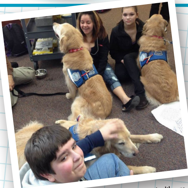
A public high school in Belvidere, IL set aside the library for students to be comforted by K-9 Comfort Dogs.

Lutheran Church Charities is a ministry that connects people with resources when a person, or a church, or a community is suffering and in need. The K-9 Comfort Dog Ministry is a national ministry utilizing the unique skills of dogs to open opportunities to touch people with mercy and compassion. After training is complete, each comfort dog is placed with an LCMS chaplain who uses the comfort dog as part of his crisis ministry. The dogs are able to meet a need that simple conversation cannot. Based on the positive initial contact with the comfort dogs, chaplains can continue to meet the needs of people in crisis through the comfort of the Gospel.