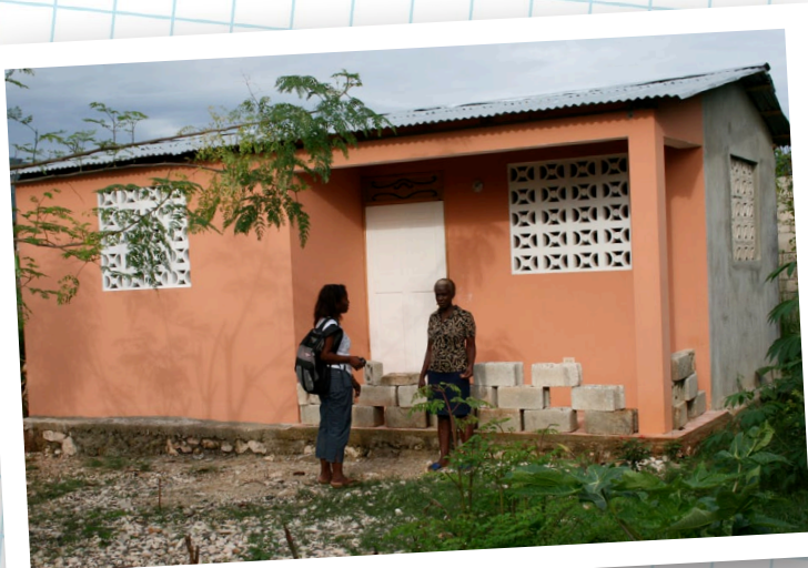
Two Haitian women visit outside a "Building Homes and Hope in Haiti" home in Jacmel. Staff at each location will develop a maintenance schedule, emergency and safety procedures and enforce community living standards.

The Lutheran Church—Missouri Synod (LCMS) Office of International Missions helps people in need in the clear name of Jesus Christ. It is currently working to provide permanent housing in Haiti through Building Homes and Hope in Haiti. The vision of the project is to build 300 homes in each of five locations in Haiti over the next few years. Families may apply to own a home through a loan or grant program.