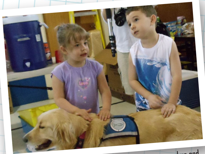
Two children affected by Joplin, MO tornado destruction opened up and talked after spending time with Comfort Dogs

Gracious Heavenly Father, You see people in need and have provided the greatest comfort of all through salvation. Please use the K-9 Comfort Dog Ministry to give physical comfort to those who are hurting. Let the gentle loving nature of these animals soothe deep needs in times of crisis. Give the handlers and chaplains patience and wisdom so they are ready with Your words of comfort when the time is right. Help us all to reach out with Your love when there is need in our communities. In Jesus' precious name we pray. Amen