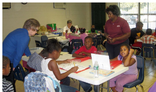
Tutoring at Our Savior Lutheran Church, Orlando, FL

Dear Lord, there are thousands of underprivileged at-risk children that live in unstable high-risk environments. Rebecca's Garden of Hope reaches out to provide a safe environment for these children's spiritual growth and to enhance their life skills. Bless this grant, dear Lord, so tutoring and mentoring can spiritually change these children's lives forever. In Jesus' name we pray, Amen.