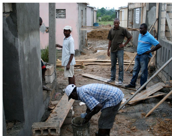
Haitian craftsmen apply a skim coat to cinderblock walls, a common building practice in Haiti. Local workers are employed to strengthen area economies that suffered greatly after the 2010 earthquake.

Dear Heavenly Father, there is a great need to fund the construction of homes in Haiti, providing permanent housing to families. Bless this LWML Grant, dear Lord. We thank and praise You that this project will be facilitated by an LCMS partner church in Haiti and thank You for the opportunity to help fund Building Homes and Hope in Haiti. In the name of Jesus we pray, Amen.