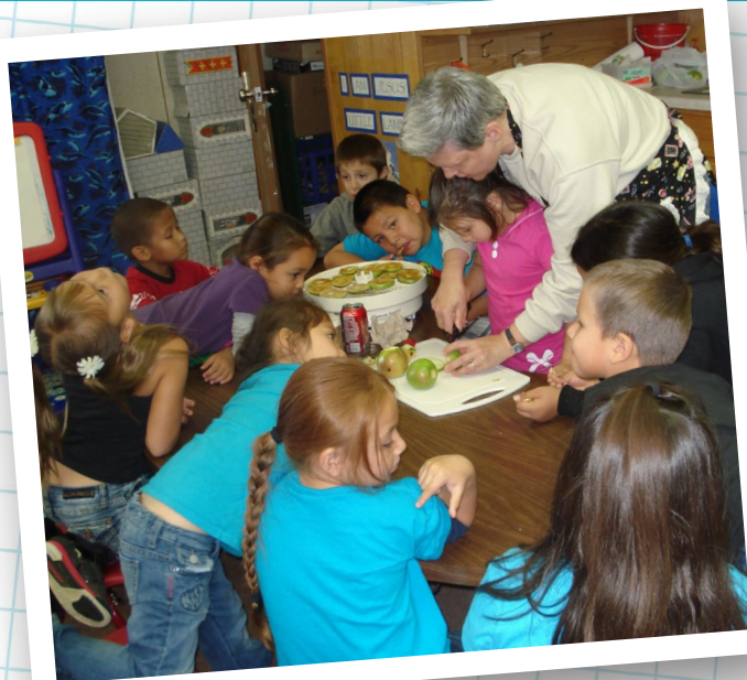
Learning about seeds.

The village of Winnebago, Nebraska, is the home of Jesus Our Savior Lutheran Schools. The first year of classes was 1997 with preschool classes for three and four-year old students. Classes are now offered to students from preschool through third grade. These classes are currently being taught by two teachers. This grant will provide two part-time assistants for two years, as well as curriculum materials, including Concordia Publishing House religion curriculum. It will also provide classroom technology to enhance learning. This outreach to American Indians in northeast Nebraska encourages young people to seek education, respect their culture, and know their Lord.