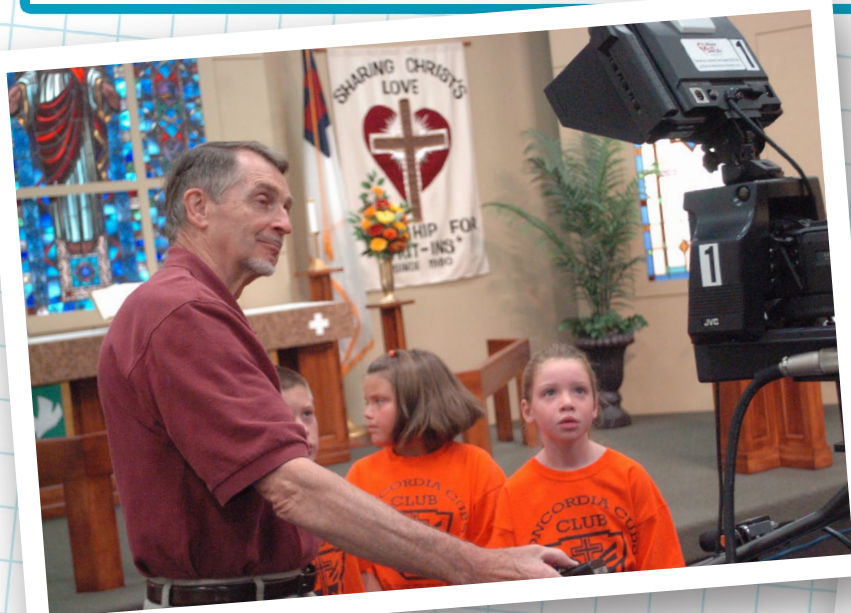
Grade school students visit the Worship for Shut-Ins studio.

LWML shares God's love with senior citizens and the infirm through the "Reach and Preach" DVD service of Lutheran Ministries Media by providing copies of "Worship for Shut-Ins" broadcasts to Lutheran and non-Lutheran retirement and nursing care centers.