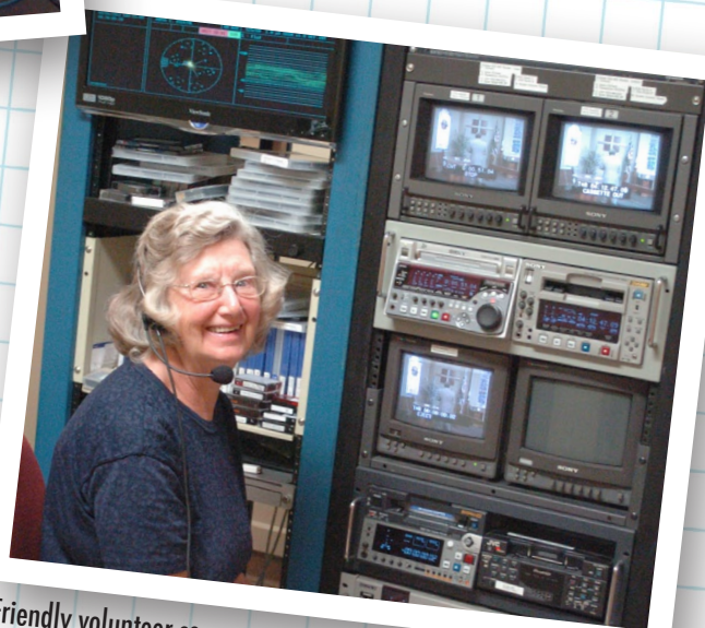
Friendly volunteer serves as sound technician during recent recording session.

Most precious Savior, You have charged us to "have mercy on our neighbors" and "to love our neighbors as ourselves." Bless this grant as it seeks to provide Your Word through the distribution of "Reach and Preach" DVDs to the ever-increasing number of seniors living in nursing homes and retirement centers. May Your Holy Spirit enter the hearts of unbelievers at these facilities to receive the saving Gospel of Jesus Christ and give strength and courage to all as they hear Your Word preached in its truth and purity. In Jesus' name. Amen.