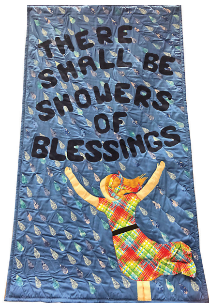
One of the many beautiful district LWML convention banners I was blessed to see. This one, from the LWML North Wisconsin District, seemed a perfect fit for the theme of this issue.