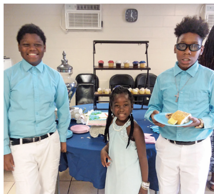
Three youth recently baptized at Our Savior in Orlando

More information can be found at www.rebeccasgardenofhope.org .