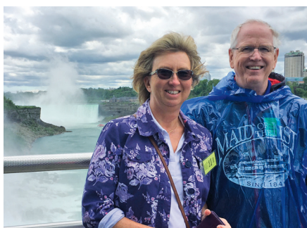
My first time visiting Niagara Falls!