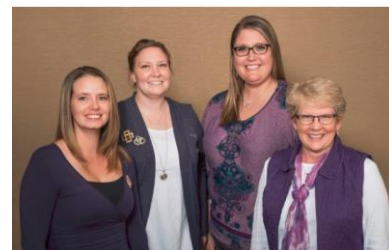
LWML Committee on Young Women