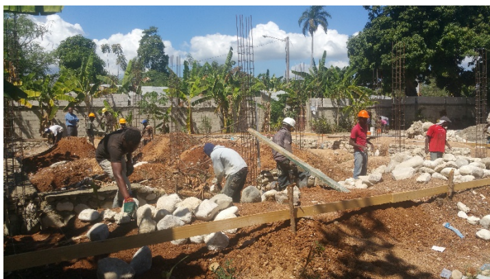
Grant #10: Groundbreaking for Christian Eldercare Home in Haiti

The center is being built on the same property where an orphanage was constructed in 2014. Recent groundbreaking will allow Ministry in Mission to create a true community for Haitian Lutherans by providing a safe living environment for all Haitians in the surrounding area and particularly the forgotten elderly society.