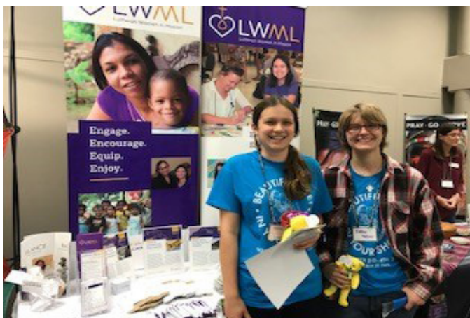
Young visitors at the LWML table.

Beautiful Feet is an annual conference that is hosted by one of the Concordia Universities to share opportunities with college students for foreign and domestic missions and equip them to daily be in mission as disciples of Jesus. Beautiful Feet comes from Romans 10:15, "How beautiful are the feet of those who preach the good news!" This year's conference focused on The Great Commission, "Go therefore and make disciples of all nations, baptizing them in the name of the Father and of the Son and of the Holy Spirit, teaching them to observe all that I have commanded you. And behold, I am with you always, to the end of the age" (Matthew 28:19-20).