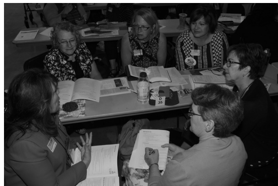
WOMEN IN SMALL GROUPS REFLECT ON WITNESSING AND SERVING