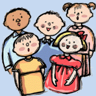
Friends in Faith Choir

Friends in Faith kids' choir ALWAYS sing or play bells on the 2 nd Sunday of the month. Please have them at church by 9:40 to go over the songs! Thanks!