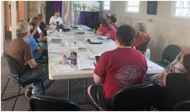
Leadership Meeting 2023