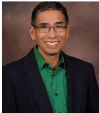
Ramon Joson Grande Park • 29 Nov 2021

As one of our recipients said, "You made me a Christian". Many of our homeless friends think that being kind and respectful to them is religious. If you can't help, please pray for them. If you can help, please visit: bluejeansforthehomeless.org Have a wonderful day!