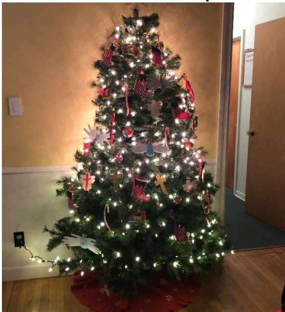
Christmas tree in Sanctuary decorated with homemade ornaments created by the children of LFCC

Christmas Candlelight Service December 22 nd at 6:00pm