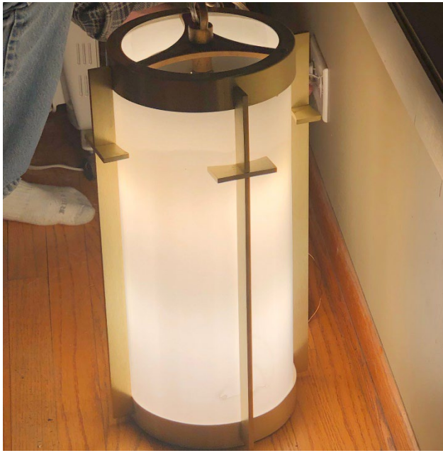
Our beautiful lights in the Sanctuary