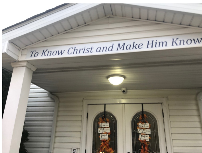
Art that adorns our church doors changed every season created by Carol Billow