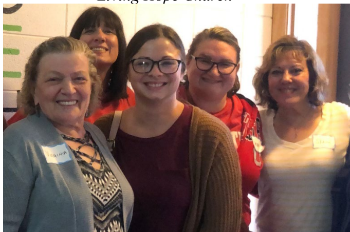
Living Alternatives Banquet