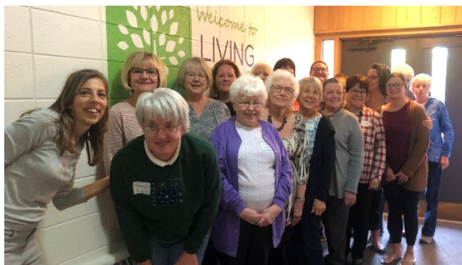
"Revive Our Hearts" Women's Conference at Living Hope Church

Since the last Newsletter so many things have been happening!