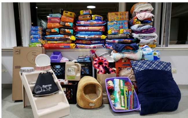
Christmas Toys and Food for our furry clients, 2018